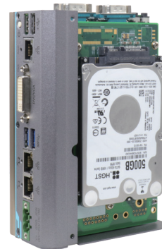
▲ POC-300 with MeziO™ - R11 and 2.5" HDD

** For sub-zero operating temperature, a wide temperature HDD drive or Solid State Disk (SSD) is required.